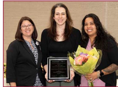
Structural Empowerment Emergency Department Unit Based Practice Council Emergency Department