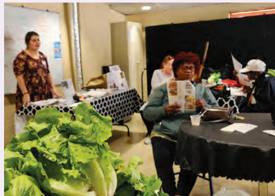
Above top: Community Medical Center and RWJBarnabas Health volunteers join partners from the Sadie Vickers Community Resource Center to create a community garden in South Toms River. Above bottom: A similar effort at Robert Wood Johnson University Hospital Hamilton expands a Farm to Family program.