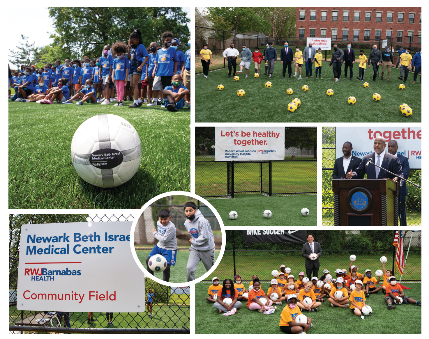
Opposite page and above, local children and officials participated in field openings in urban neighborhoods in Newark, New Brunswick and Hamilton.

an anchor for further revitalization of a neighborhood or expansion of community sports facilities.