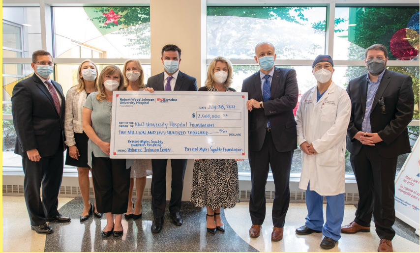
Representatives from The Bristol-Myers Squibb Children’s Hospital (BMSCH) at Robert Wood Johnson University Hospital and the Bristol Myers Squibb Foundation gather to mark the Foundation’s commitment of $2.5 million in support of BMSCH’s new pediatric infusion center.