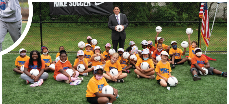
Opposite page and above, local children and officials participated in field openings in urban neighborhoods in Newark, New Brunswick and Hamilton.

an anchor for further revitalization of a neighborhood or expansion of community sports facilities.