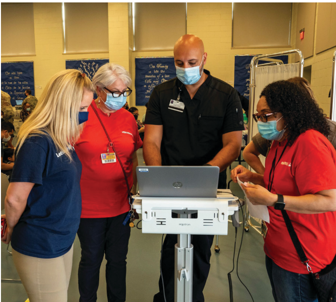
Members of the RWJUH Community Health Promotions team (above) have provided accurate information, adapted timing of COVID-19 vaccination clinics and taken other steps to make shots more convenient and less stressful for area residents.