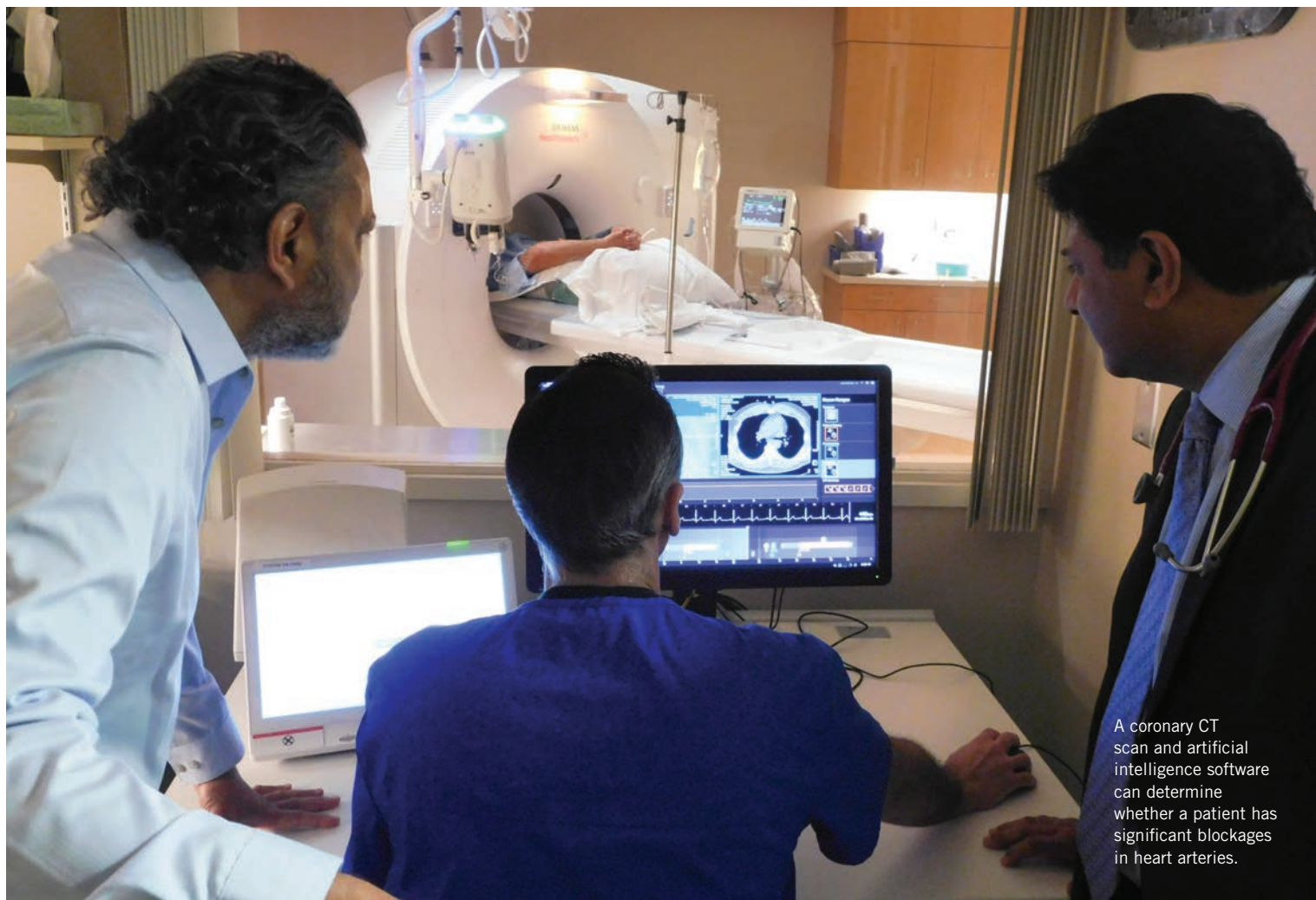
A coronary CT scan and artificial intelligence software can determine whether a patient has significant blockages in heart arteries.