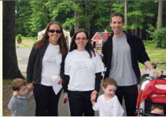
JCC Mitzvah Walk to benefit Pediatrics