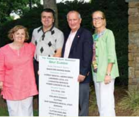
Friends of Saint Barnabas Golf Open Committee Members