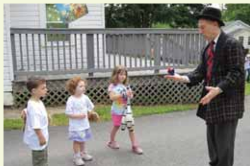
Children participate in the West Orange JCC Preschool Mitzvah Walk to raise money for the Pediatric Department at Saint Barnabas Medical Center.

For more information, please call the Saint Barnabas Medical Center Foundation at 973.322.4321 .