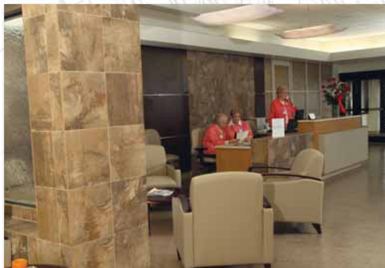
A fountain completes the serene setting of the lobby inside the Continuing Care Building.

But the learning center isn’t the only improvement to the Continuing Care Building. CMMC also now proudly welcomes visitors to the Continuing Care Building through its brand new lobby, to a spacious reception desk and comfortable sitting area. A waterfall feature highlights the space, which was designed in calming earth tones, and complements the granite and stone accents throughout the lobby.