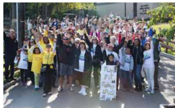
Volunteers supported the Lifeline Challenge program by walking at the Turtle Back Zoo

Pleasantdale Chateau, West Orange, New Jersey