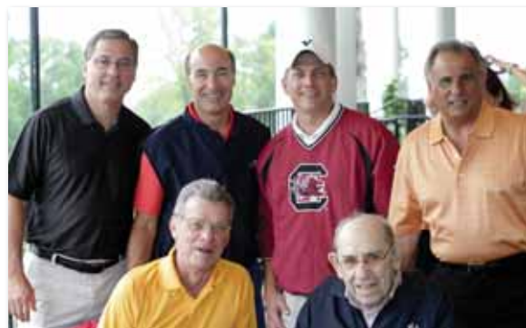
Golfers from Barnabas Health spent the day with baseball great Yogi Berra, bottom right, at the CMMC Foundation's annual golf outing.