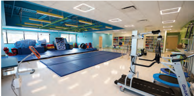
Outpatient services include facilities and equipment specially designed to meet children's needs.