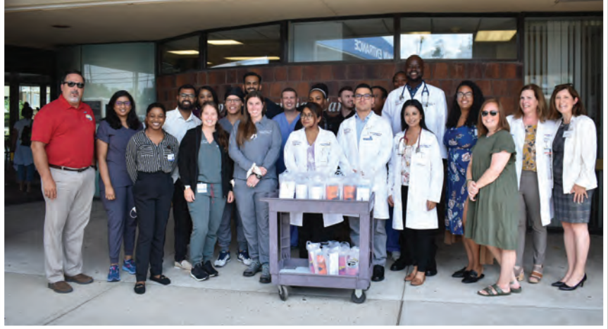
The Greater Toms River Chamber of Commerce distributes gifts to new physicians in CMC’s Residency Program.