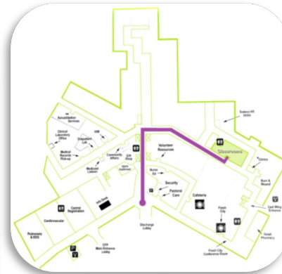
MAIN ENTRANCE (Auditorium A Classrooms A-D)