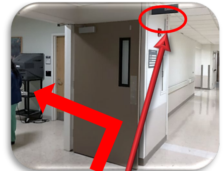
Classrooms on right