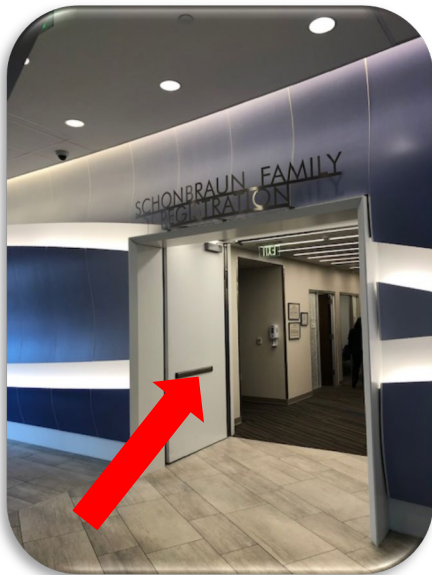
Go through the Schonbraun Family