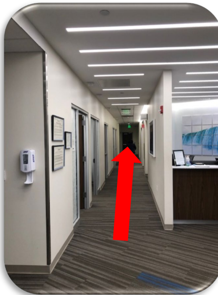
Continue down hallway