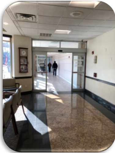
Enter through main entrance and make a left