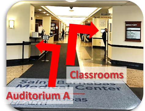
Classrooms continue straight. At the end make a right