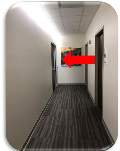
Make a left into GW - 409