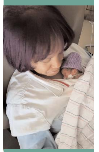
Jade in the NICU