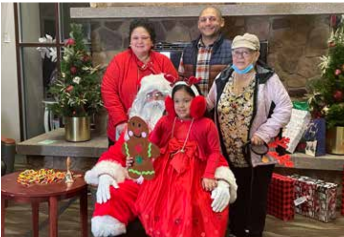
Families visit with Santa.