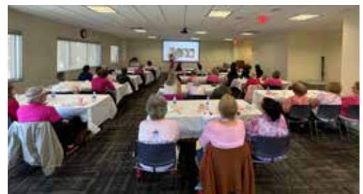
Attendees at "It's a Pink Party" luncheon.