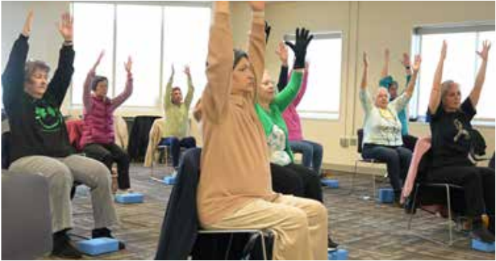
Patients and their caregivers participate in Chair Yoga.