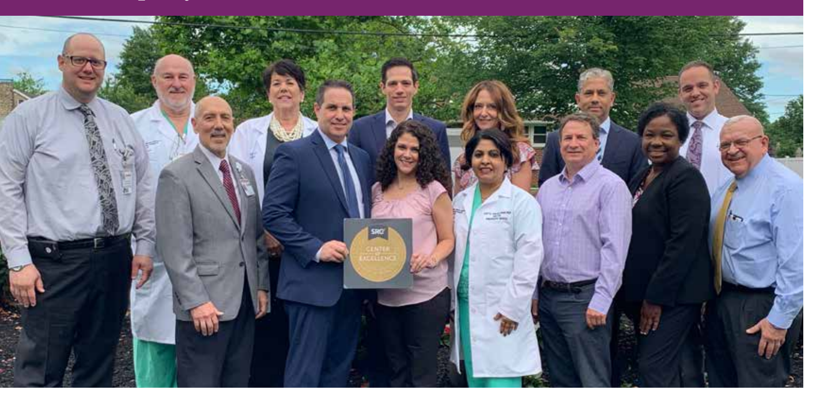
The bariatric team celebrates reaccreditation as a Center of Excellence.

The true essence of a Magnet<sup>®</sup> organization stems from the nurses' exemplary professional practice. RWJUH Somerset nurses are competent, accountable, autonomous practitioners who uphold ethical, safety and regulatory standards while striving for excellence through the application of evidence-based practice. Our nurses embrace the principles of exemplary professional practice as evidenced by our professional practice model and overarching care delivery model that places the patient and family in the center of all that we do.